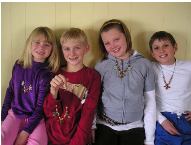
Pass Creek students displaying their finished necklaces

The YEWTHS ROC Program, now in its second year, continues to inspire youth to make a positive difference in the lives of others. Over 150 students in the Gallatin Valley are engaged in reaching out and caring for others by creating products to raise money to sponsor ROC chairs for children in Mexico and Tanzania. Students at Monforton, Emily Dickinson, and Pass Creek Schools have been hard at work creating ROC Beads and ROC dolls to sell at their holiday programs. Sunrise Medical has already purchased 200 ROC dolls to give out at their annual conference in April. That alone is enough to sponsor six wheelchairs! That translates into six children who can go to school, go out into their communities, play with their peers and be involved in the day to day activities of their families. Thank you Sunrise Medical!