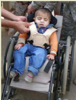
An Iraq ROC Chair fitting

ROC Wheels, Inc. 4135 Valley Commons Drive, Suite D Bozeman, MT 59718 Ph/Fax: 406-556-8065 www.ROCWheels.org