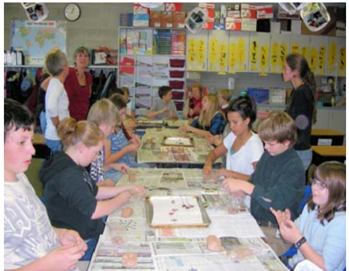
Monforton students sculpting ROC Beads

difference in their world. In addition to learning new skills in the arts, students will broaden their knowledge of the world by learning about the cultures of Mexico and Tanzania, increase their understanding and acceptance of disabilities and make a personal connection with the children in