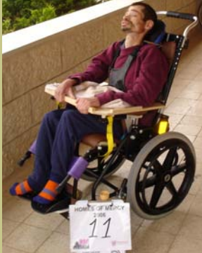
Much improved body position and support for this gentleman