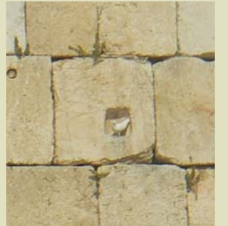
A white dove resting on an indent in the Wailing Wall