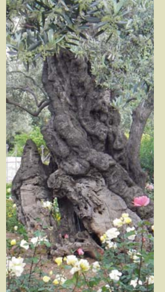
An ancient olive tree in The Garden of Gethsemane on the Mount of Olives

wheelchairs for three days at the First Ladies Hospital and outlying areas. On the morning of day four we will travel through the heart of Mali to our next base of operations in Mopti. Teams will spread out into the surrounding Villages of Sendegue and Dera to distribute wheelchairs and provide medical services for two days. The seventh day the team will tour the Dogon cliff villages. The Dogon are a people with an ancient history and amazing culture. In the evening we will take part in a celebratory feast. On the eighth day we will drive back to Bomako for our return flights on the following day. On the way back we will visit Djenne, a World Heritage Sight, and home of The Great Mosque, the worlds largest clay structure. We are still searching for partnering organizations and clubs to help cover the financial obligations. Space is limited so please contact ROC soon if you are interested!