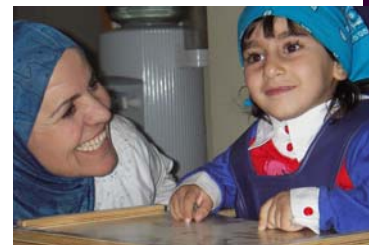
Big smiles in Ramallah, West Bank