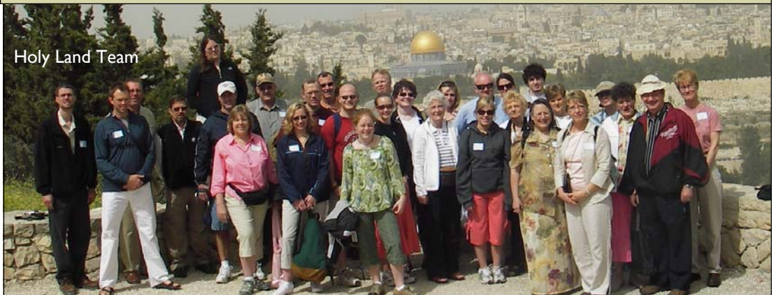
Holy Land Team

Providing mobility products without regard to political affiliation, religious belief or ethnic identity.