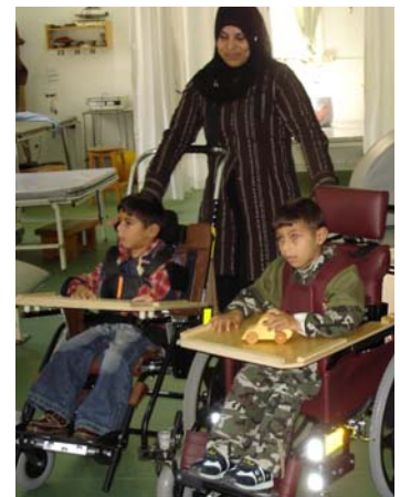
This mother's 2 sons each received new wheelchairs

out of the Clinic pushing her two sons was overpowering. In that short period of time many lives were changed.