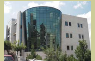
Abu Raya Rehabilitation Center Funded by the State of Kuwait

ROC Wheels received a $5,000 grant from The Jerusalem Fund for the cost of 16 ROC Chairs for the Holy Land Trip. The bulk of the ROC Chairs were distributed at the Abu Raya Rehabilitation Center in Ramallah (newly renovated)