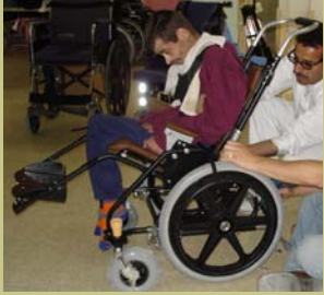
Beginning of Custom Fitting