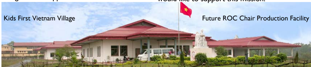
Future ROC Chair Production Facility

! NEW ADDRESS ! ROC WHEELS INC 4135 VALLEY COMMON DRIVE, UNIT D BOZEMAN, MT 59718